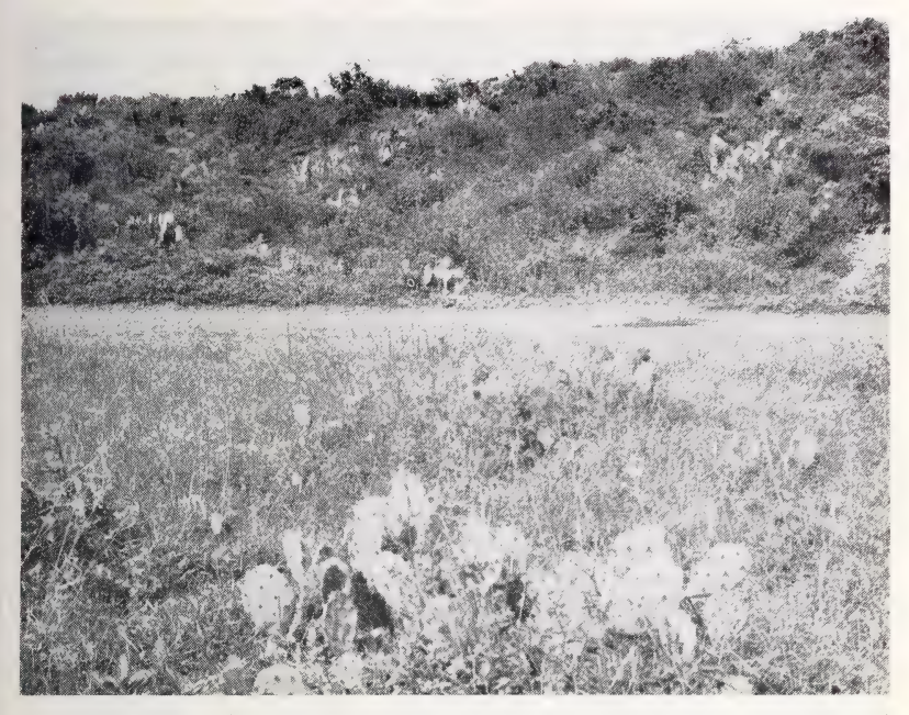
Fig. 3. Type locality of Ophisaurus ceroni Holman. Coastal dune-scrub at Veracruz, Veracruz, Mexico, September 3, 1965.